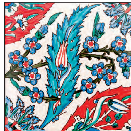
Though based on ancient historical designs, Turkish-inspired tiles are remarkably contemporary in their rich use of color and graphics.