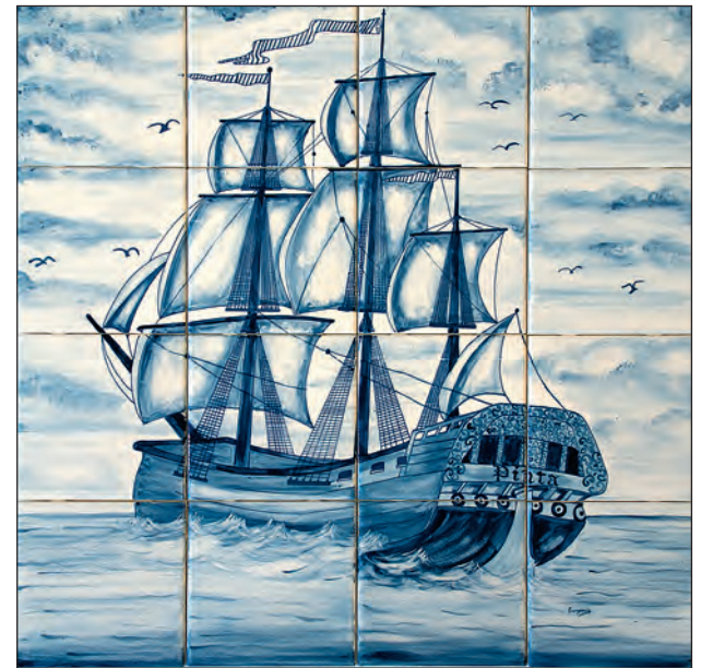
This distinctive, hand-painted delft blue-and-white tile panel depicts a late-1700s Dutch sailing vessel.

The opinions expressed in Real Estate Weekend are those of the author and do not necessarily reflect the opinion of The Palm Beach Post .