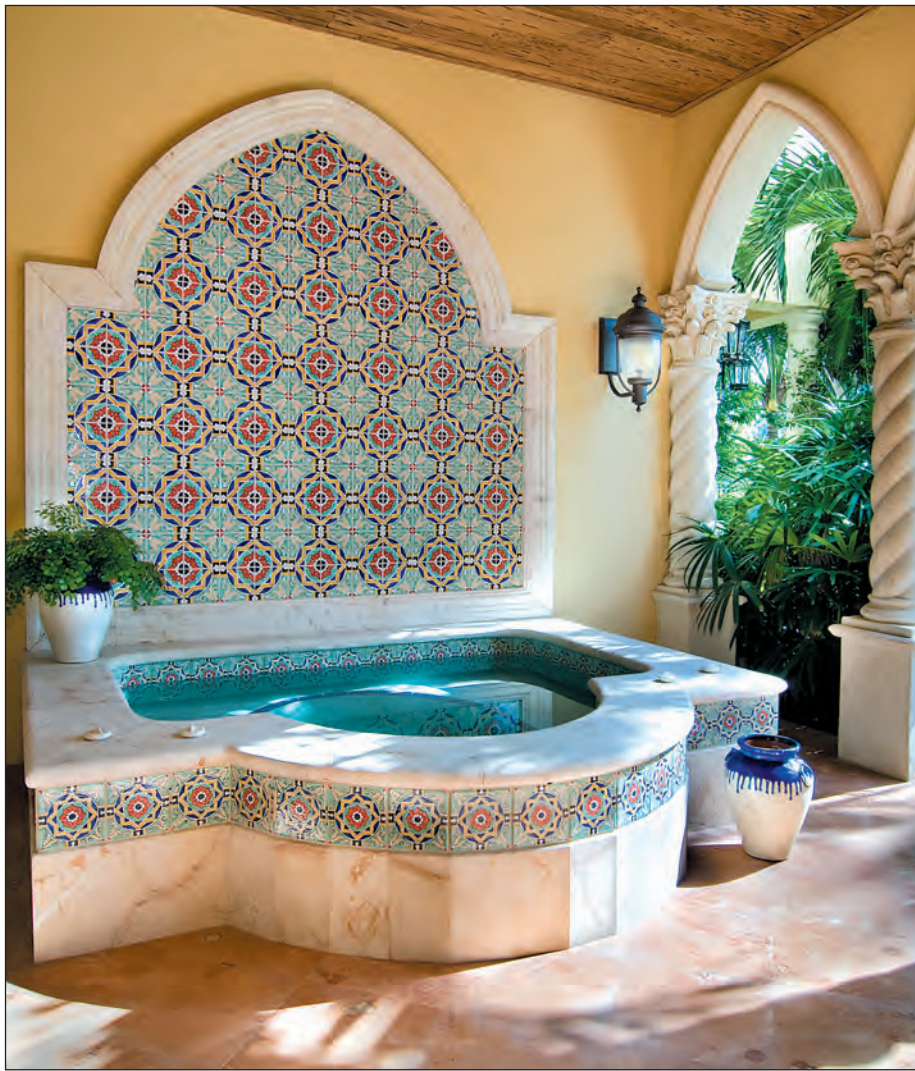
From fountains (above), pools, patios, floors, walls and ceilings, tiles are a great way to express your personality. Tiles are painted by hand (below) using the refined techniques that have been passed down from masters of the art.